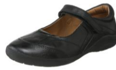
Mary Janes (navy or black)